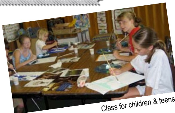
Class for children & teens

free art-related programs at Batavia Public Library and additional art classes offered by Water Street Studios this summer!